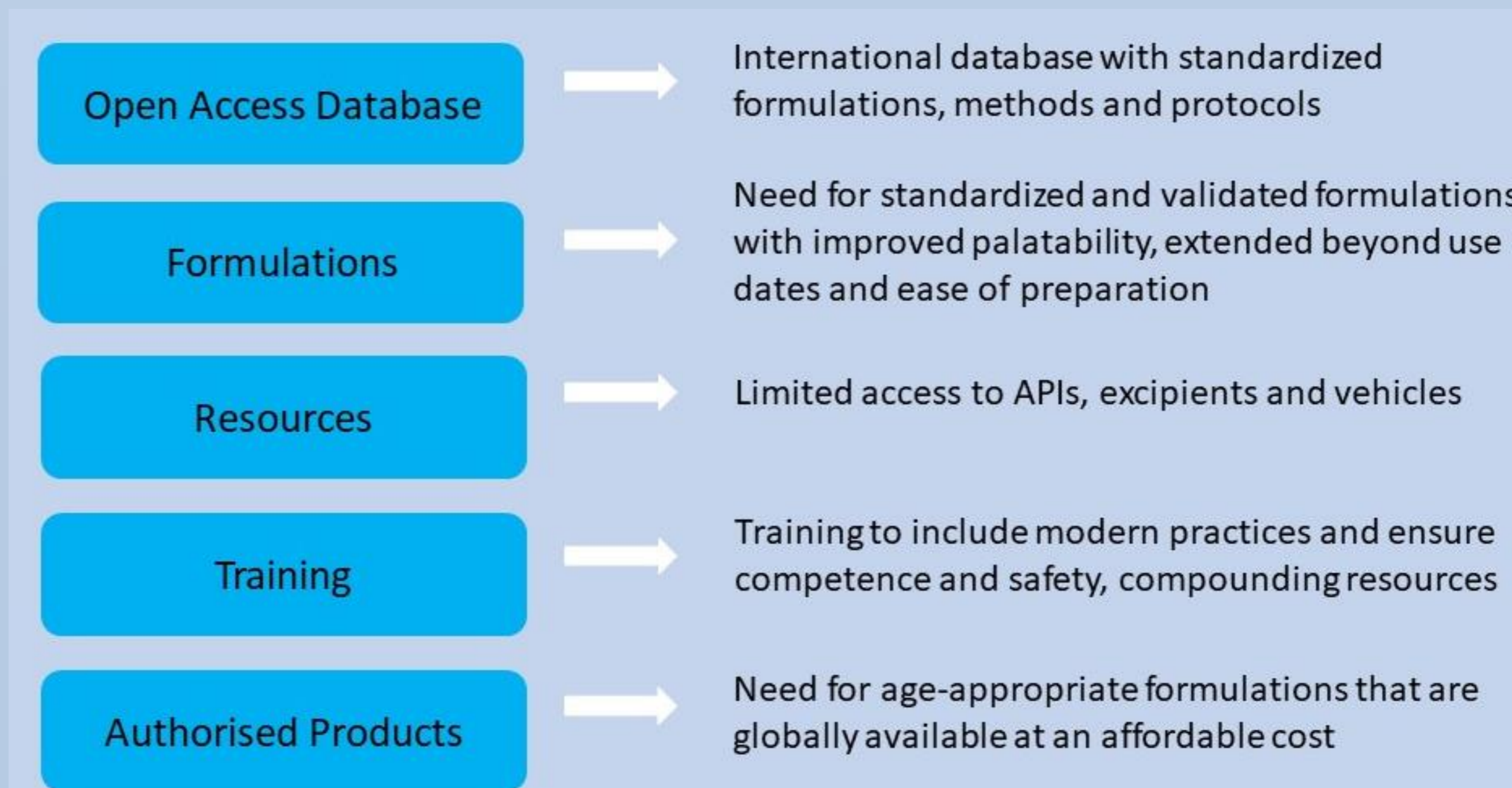
Figure 4. Areas of development for paediatric oral extemporaneous compounding.