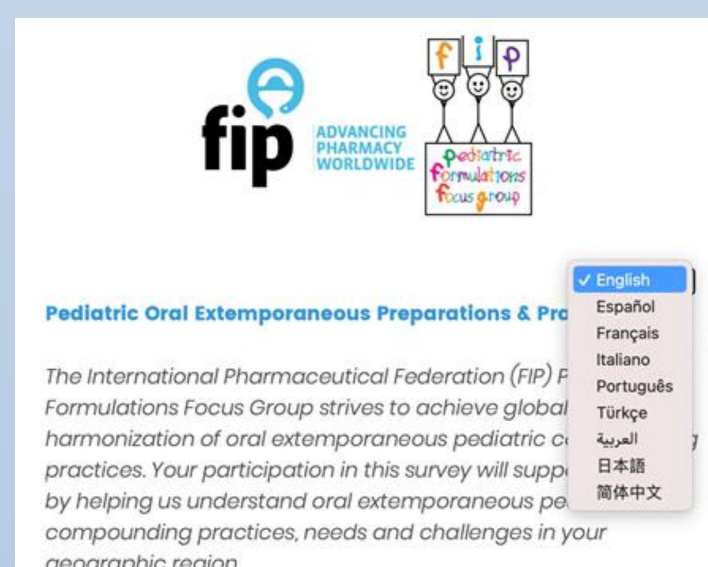
Figure 1. FIP PFFG global survey.

An anonymous web-based survey (Qualtrics) was developed and translated into 9 languages in collaboration with compounding experts from all WHO regions (Figure 1). The survey includes 16 closed and open-ended questions distributed in three parts: (1) Paediatric oral extemporaneous preparations: dosage forms and active pharmaceutical ingredients (2) Paediatric oral liquids: solutions, suspensions and syrups; and (3) Pharmacy practice. The introduction to the survey included a consent statement and a conditional branching question to identify respondents that currently prepare paediatric oral extemporaneous preparations. A pilot survey was used to test and optimize the official survey, which was launched on November 1st, 2021 and closed on June 1st, 2022. The FIP PFFG global survey was distributed through FIP member organizations, as well as professional networks and contacts by compounding experts worldwide.