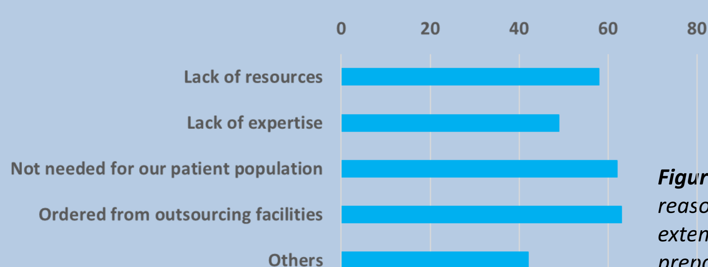
Figure 2. Most prevalent reasons why paediatric oral extemporaneous preparations are not pursued.

A total of 730 valid responses were collected during the 7-months duration of the survey. Most responses came from Europe, Western Pacific, Eastern Mediterranean and South America. Hospital pharmacy and community/compounding pharmacy were equally represented in the survey; outsourcing facilities were a minority. Over 60% of respondents currently prepare paediatric oral extemporaneous preparations; the reasons appointed by the others for not compounding were as follows: ordered from outsourcing facilities; not needed for their patient populations; lack of resources and expertise (Figure 2).